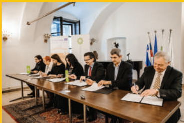
Representatives of partners of the project OISAIR: Establishment of the Open Innovation System of the Adriatic Ionian Region signed on June 7th 2019 in Ljubljana a Collaboration Agreement that formalize the establishment of the OIS-AIR Network.

The OISAIR Network has a flexible design and it's open to new stakeholders of the innovation ecosystem in the Adriatic - Ionian Region.