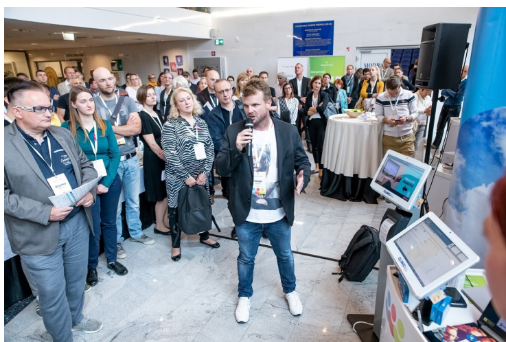
A highlight from the Show of innovation.

These innovative companies are definitely worth your attention and we believe they will shape the future to come!