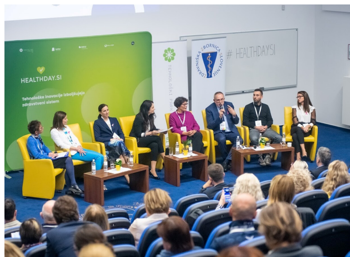
Central round-table discussion between the quadruple-helix stakeholders in (digital) healthcare.

In panel discussion entitled: Digital transformation of the healthcare system - Are we proactive enough? participants agreed that the patient should be at the forefront, as well as shortening the implementation and certification time of the devices, and making the solutions user-friendly.