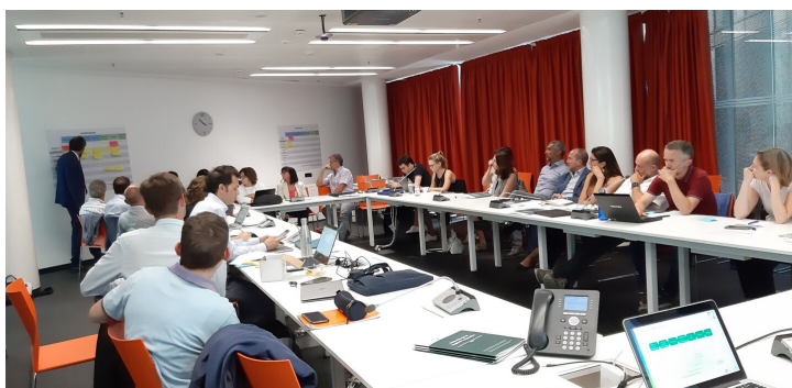
Sustainable Development Strategy workshop, July 15th.

The results of this consultation will also provide additional input for the definition of Lombardy Circular Economy Roadmap . AFIL is coordinating this inter-cluster activities gathering all the relevant inputs coming from its WG participants and other Lombardy stakeholders with the intent to elaborate a document highlighting the R&I priorities related to Circular Economy.